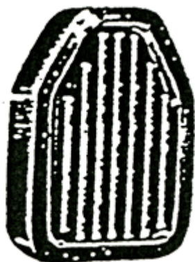
29 SIMCA 1000