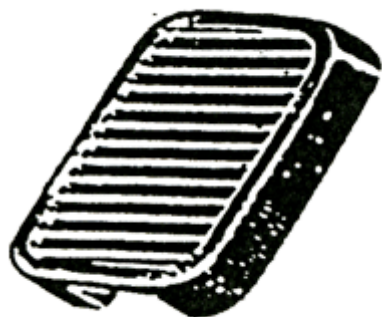
4 600 multipla